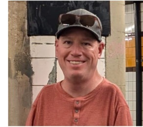
Dan Giacobbe Housing Program