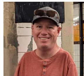
Dan Giacobbe Housing Program